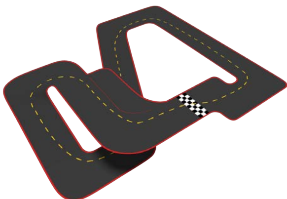
T3 - Circuit de Suzuka